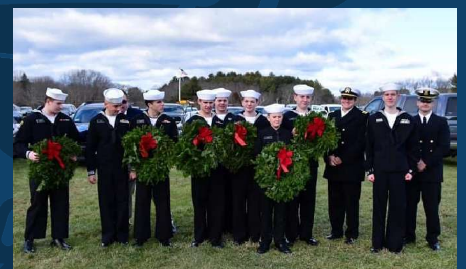
RI Corps USNSC participating in Wreaths Across America ceremony at the Rhode Island Veterans Memorial Cemetery (Exeter, RI)

Locally, Sea Cadets have called Quonset Point/ Davisville home since 1964.