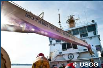
USCGC Ida Lewis (WLM-551)