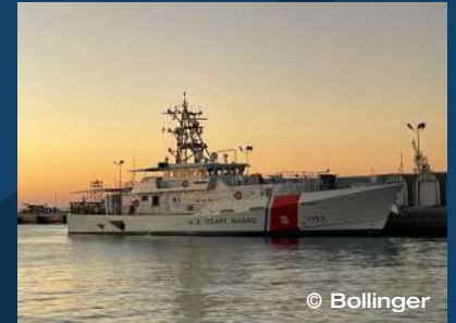
USCGC Maurice Jester (WPC-1152)

The USCGC Maurice Jester will be the third of six FRCs to be homeported in Sector Boston, which is known as "The Birthplace of the Coast Guard." The sector is responsible for coastal safety, security, and environmental protection from the New Hampshire-Massachusetts border southward to Plymouth, Massachusetts out to 200nm offshore. Sector Boston directs over 1,500 members whose mission is to protect and secure vital infrastructure, rescue mariners in peril at sea, enforce federal law, maintain navigable waterways, and respond to all hazards.