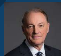
The Honorable Ronald K. Machtley

The Navy League congratulates Portsmouth resident, The Honorable Ronald K. Machtley who was unanimously appointed to the NWCF Board of Trustees in January 2023 to a three-year term. He has been a steadfast supporter of the U.S. Naval War College (USNWC) as a Life Member of the NWCF, and is bringing decades of experience in higher education, military and public service, and nonprofit leadership to the NWCF Board.