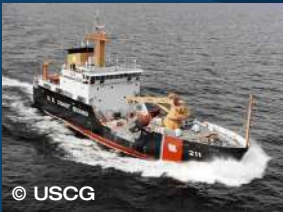
USCGC Oak (WLB-211)

"I love working in the kitchen and learning how to cook in different styles. I also wanted to share my own culture with others. I made a homemade lumpia and chicken adobo and the crew loved it. When I put out food that people enjoy, especially the crew, my reward is seeing the crew smile and enjoy the food especially before and after a long day of work. I've been blessed with many great leaders, mentors, friends, and opportunities that amaze me each day. I have so much fun being in the USCG."