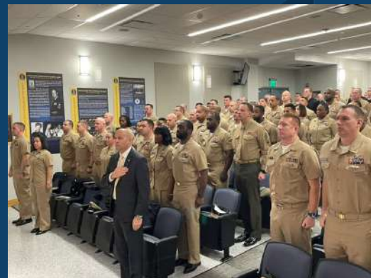
Opening Ceremony of SEA 258 Graduation in Tomich Hall, 27 January Naval Station Newport