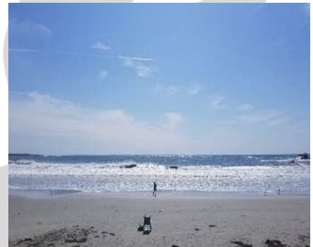
Deserted Third Beach