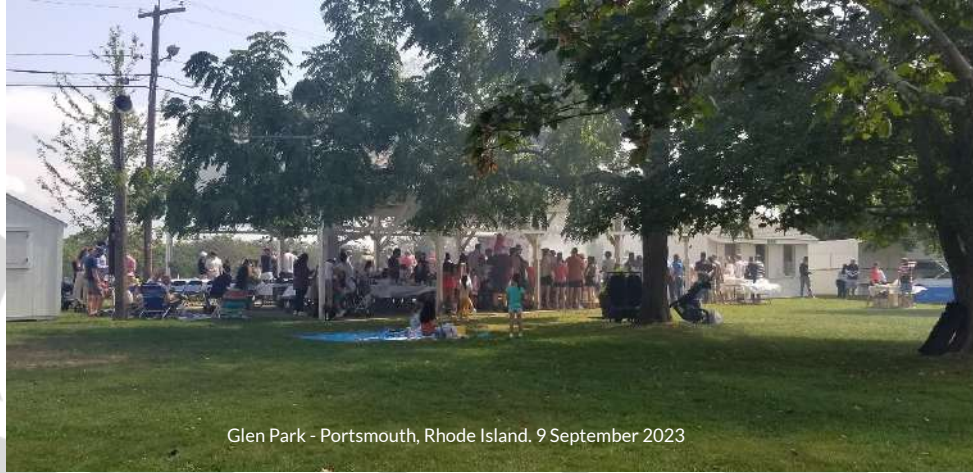
Glen Park - Portsmouth, Rhode Island. 9 September 2023