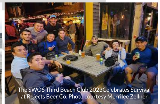
The SWOS Third Beach Club 2023 Celebrates Survival at Rejects Beer Co.

"Citizens in Support of the Sea Services"