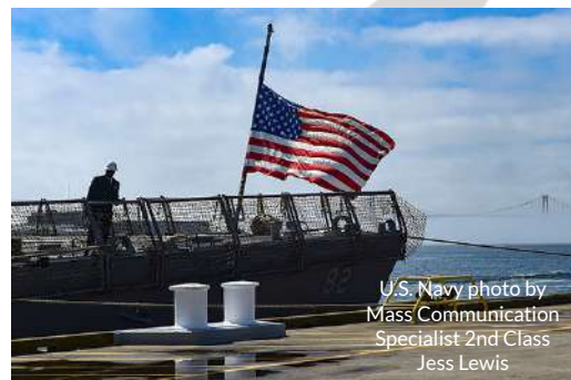
The guided-missile destroyer USS Lassen (DDG 82) arrives at Naval Station Newport

Occurring every 2 years, ISS is unique as it is the only forum in the world that brings together the heads of so many navies at the same time to enhance maritime security and collaborative operations. The CNO's goal is to present wide-ranging platforms for individual thoughts and proposals for enhancing regional and global maritime security for discussions leading to many successful efforts in enhancing cooperation in countering piracy; providing humanitarian aid; disaster relief; coordinating search and rescue missions at sea, and fisheries and pollution violations. Significant joint military operations to manage security threats, countering arms, drug and human trafficking were also discussed.