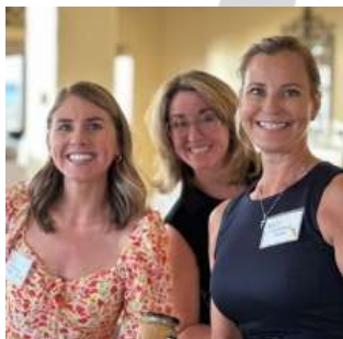
Welcome Social Thank you from MSON and President and Committee Members. Well done!