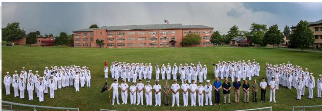
Picture includes Corps, Leaders, Trainers and Staffing. Falcon Division received a ranking of 25th in the nation for 2022 out of 319 Sea Cadet Units nationally.