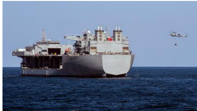
An MH-60R Seahawk helicopter assigned to Helicopter Maritime Strike Squadron 37 delivers cargo to the expeditionary mobile base USS Lewis B. Puller during a vertical replenishment Jan. 13 in the Arabian Sea. Puller was deployed with the Theodore Roosevelt Carrier Strike Group to the U.S. 5th Fleet area of operations.

The SPMAGTFs were created in 2014 in response to the 2012 attack on the U.S. government facilities in Benghazi, Libya, in which four Americans were killed in a siege with no ARG/MEU available in the Mediterranean Sea to rescue them.