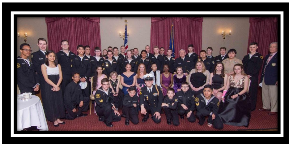
The 13 th Annual Naval Sea Cadet Ball - March 31, 2018

The Naval Sea Cadet Corps and Navy League Cadet Corps are federally chartered, youth training organizations, which help youths, ages 10-18, to explore careers in the Navy and Coast Guard, both ashore and afloat. Providing positive role models for young adults, the Naval Sea Cadet Corps objectives are to develop good citizenship, self-discipline, a greater sense of responsibility, and leadership skills. This program is open to all young Americans regardless of race, color, creed or sex. For more information on Sea Cadets visit the National web page: http://seacadets.org/