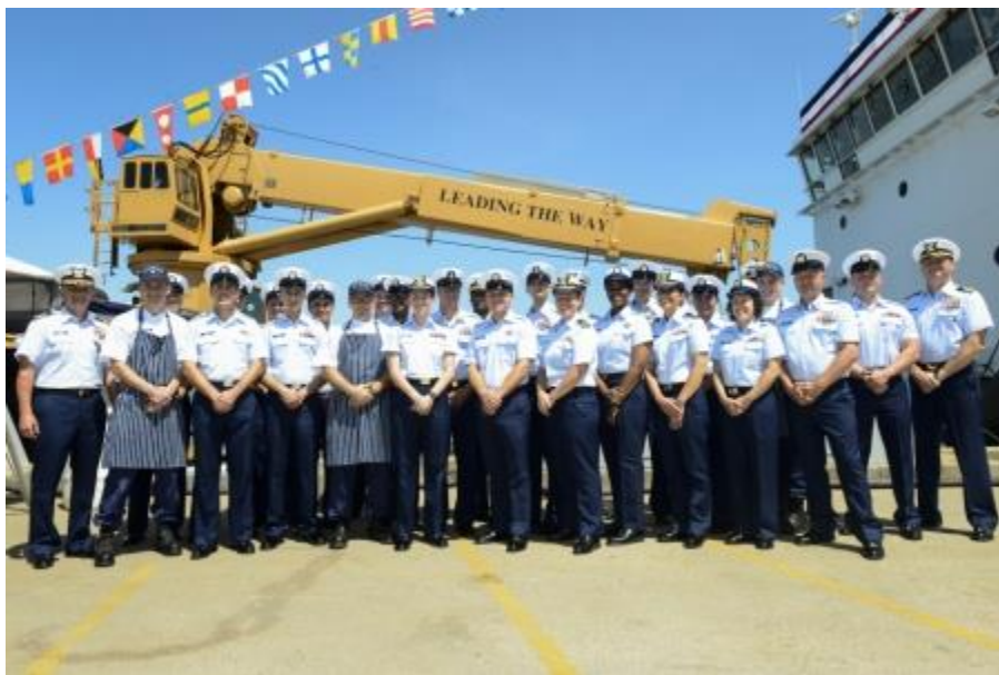
Crew of the Coast Guard Cutter Juniper

The first schooner commanded by the United States' first sea-going commissioned officer was the Scammel . Captain Hopley Yeaton, commissioned on 21 March 1791, is the first commissioned officer in the United States Revenue Cutter Service, the predecessor of the Coast Guard. Then Secretary of the Treasury Alexander Hamilton created the Revenue Cutter Service to help collect tariffs and restrict smuggling.