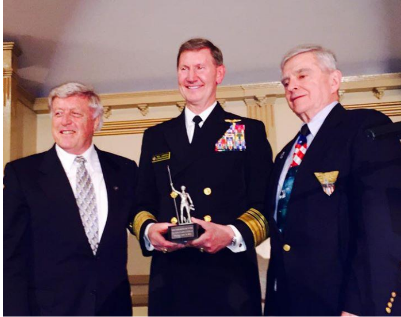
VADM Carter holding the trophy presented to him at the Induction Dinner.