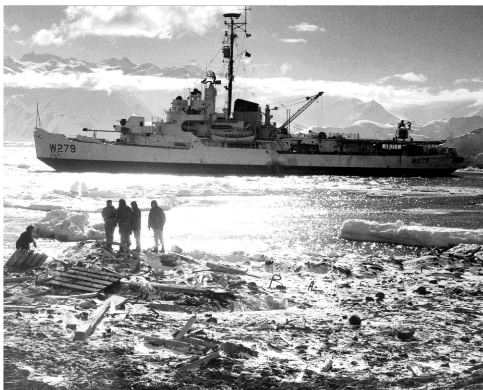
USCGC Eastwind in the Antarctic in 1963