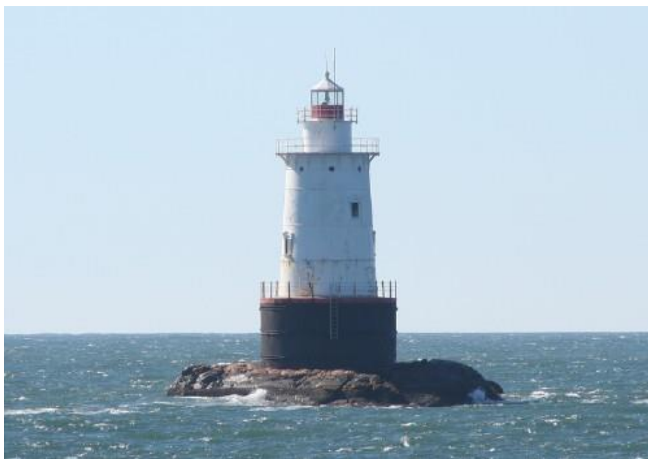
Sakonnet Light, Little Compton, RI